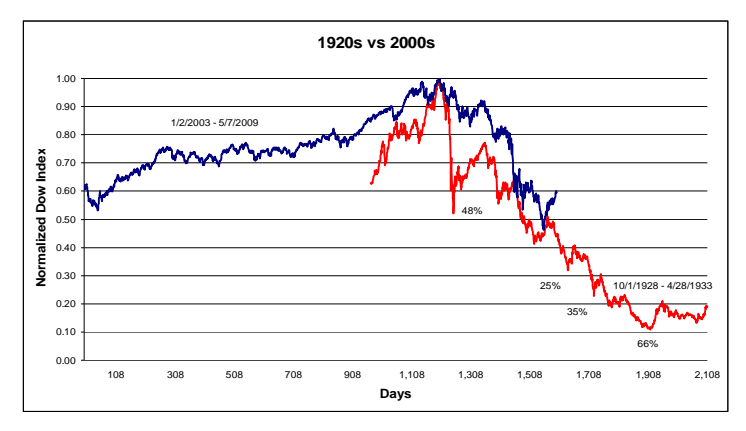
Source: Yahoo Finance, SSgA Analysis The above example is for illustrative purposes only. Past performance is no guarantee of future results

The truth is while some of the governmental actions taking place around the world today are helping in the short run, we need to admit that we are making mistakes. Hopefully, the mistakes won't be as disastrous as those in the 1930s, but we need to realize we won't get everything correct. That shouldn't prohibit the central banks of the world from being the lenders of last resort, but we should realize that sometimes trying to keep things working the way we are used to often inhibits us from finding the new normal.